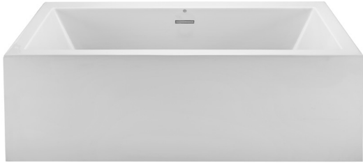
Available as a freestanding model or finished on 1, 2 or 3 sides for various installation applications.