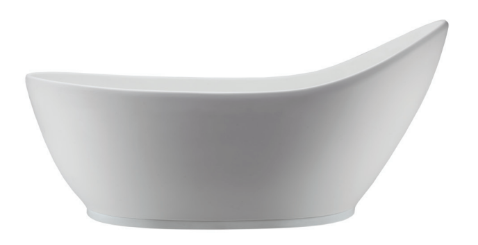
Features an integrated overflow.