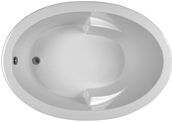
Features integral armrests. Shown with optional textured bottom.