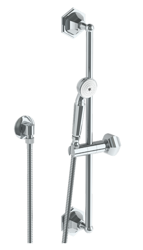
Available in all finishes shown on the Watermark Designs website